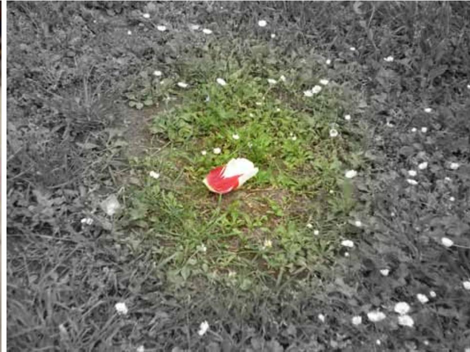
Some of the results from the photo project.