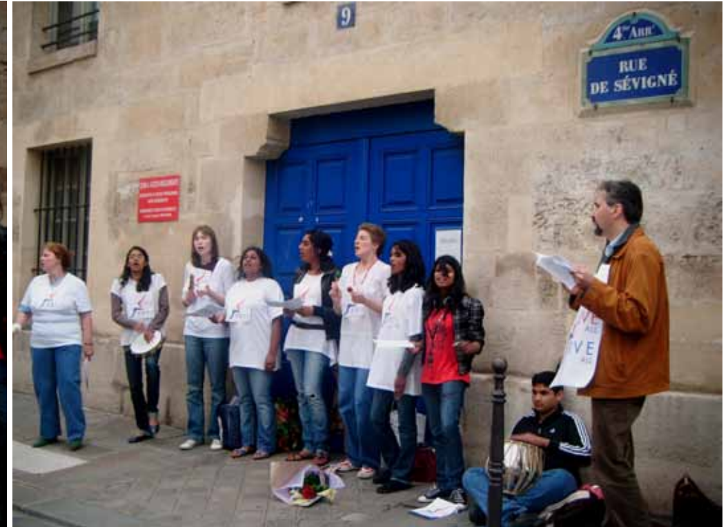
Fête de la Musique, June 21st, 2010

Each year, to celebrate summer, a music festival takes place everywhere in France.